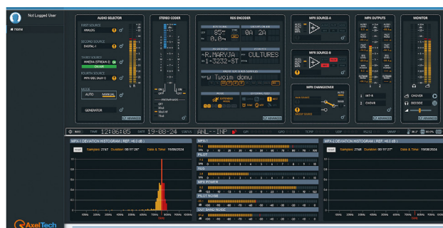
Tiger Web Controller