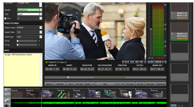
XTrimmer free tool